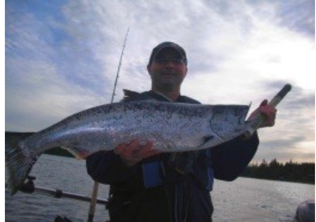
January 19, 2011 Daddy with first Salmon of 2011

West Coast wide hatcheries reported good returns of 3 year old Chinook which indicate a good return of even larger 4 year olds in 2011. September again proved to be the best month for the awesome fighting Coho Reports for 2011 indicate more of the same. A record 1.8 million Sockeye Salmon to Port Alberni. This 2011 will be another excellent year with at least 700,000 to 1.2 million.