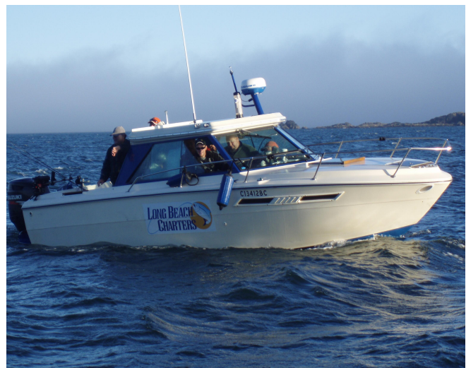
A Long Beach Charters boat