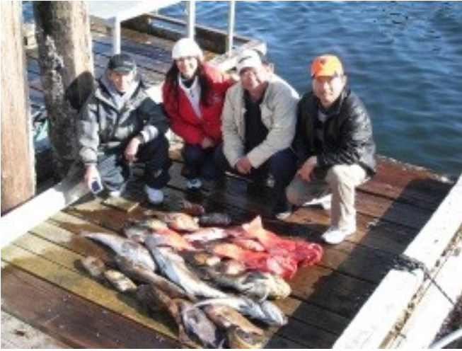
October 2010 Lingcod and Rockfish

Ling Cod – Rock Fish: Once again this last September and October were excellent for Ling Cod and Rock Fish. Guests always enjoy the jigging, bottom bouncing for this multi-color bounty which always surprises with various species and sizes, including Rock Fish up to 10lbs., Ling Cod up to 30lbs., and even Halibut over 50lbs.