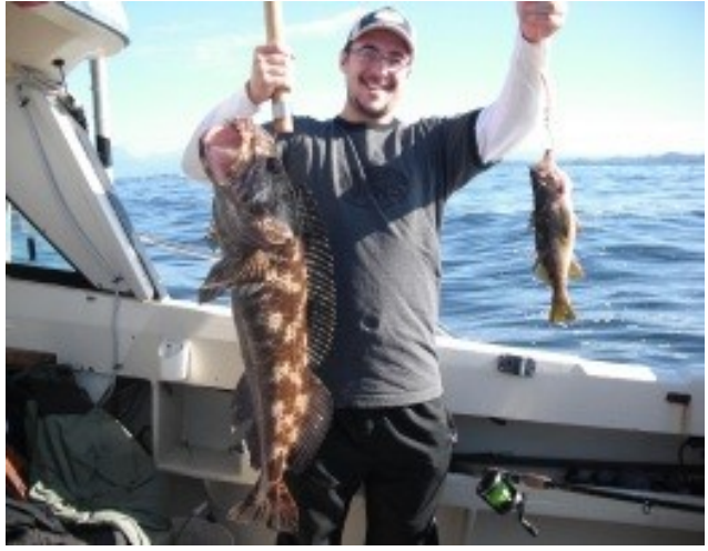
October 2010 Lingcod bit onto small fish!

Thank you all for supporting the First annual Ucluelet Salmon Ladder Derby. We had a great summer, caught a lot of big fish, and gave away $39,500 in cash between May and September. The importance of being responsible stewards of our precious salmon, a rich natural resource, made headlines Vancouver Island-wide, plastered in store windows, bulletin boards, web blogs, and fish forums! The Ucluelet community came together to support the cause, and to celebrate with one another at the Ucluelet Salmon Festival! Look forward to the second annual Ucluelet Salmon Ladder Derby this summer 2011.